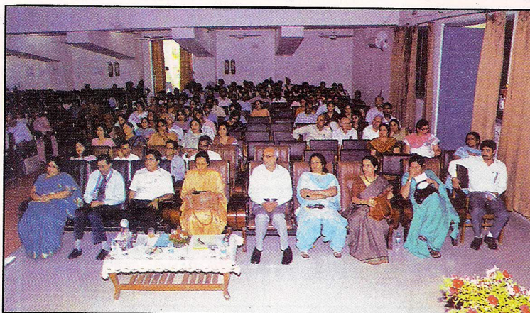
A view of Participant of function for Women Savings Day Celebration at Chandigarh.